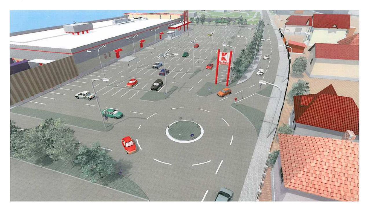
Fig. 3. The road arrangement proposal and the reglementation of road circulation in supermarket area.

The reglementation of the road circulation in the area is achieved by appropriate regulatory signs (figure 3). In this way will be solved all the problems highlighted above and will be preserved the environmental conditions and road safety on the section of the Frații Golești Street next to the school and Kretzulescu Park .